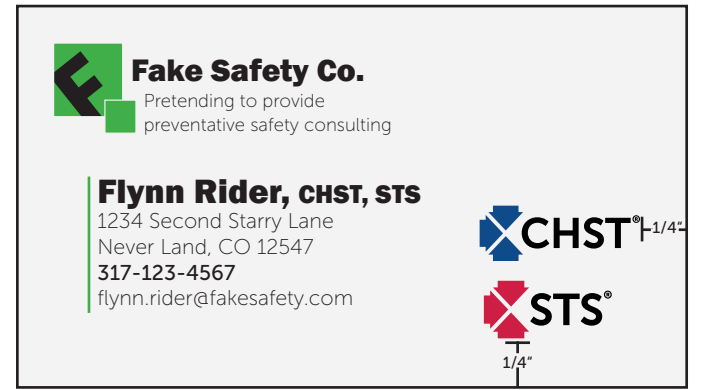
Example of sizing and placement on a business card.

3 Logos must always be solid (no outlines and must provide noticeable contrast to backgrounds).